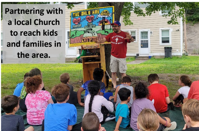
Partnering with a local Church to reach kids and families in the area.