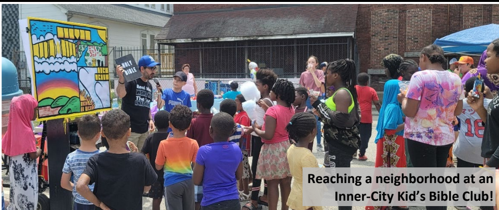
Reaching a neighborhood at an Inner-City Kid's Bible Club!

Please see for yourself the IMPORTANT truths they learned in a video called "Kids are Smart!!! Theology at Camp." See it at: https://SmartKids.Luke-15.org Warning: you'll be encouraged! ☺