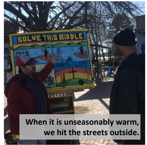
When it is unseasonably warm, we hit the streets outside.