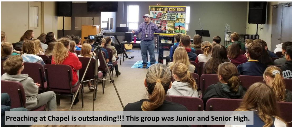
Preaching at Chapel is outstanding!!! This group was Junior and Senior High.