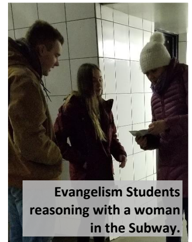
Evangelism Students reasoning with a woman in the Subway.