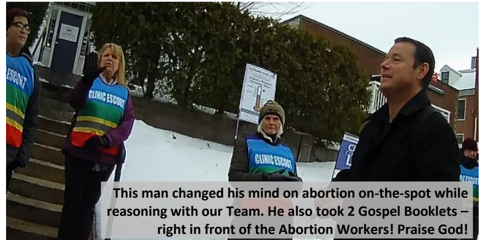
This man changed his mind on abortion on-the-spot while reasoning with our Team. He also took 2 Gospel Booklets – right in front of the Abortion Workers! Praise God!