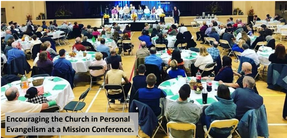
Encouraging the Church in Personal Evangelism at a Mission Conference.