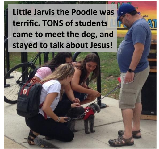
Little Jarvis the Poodle was terrific. TONS of students came to meet the dog, and stayed to talk about Jesus!