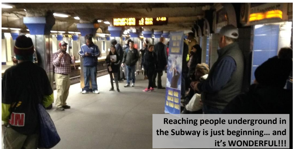
Reaching people underground in the Subway is just beginning... and it's WONDERFUL!!!