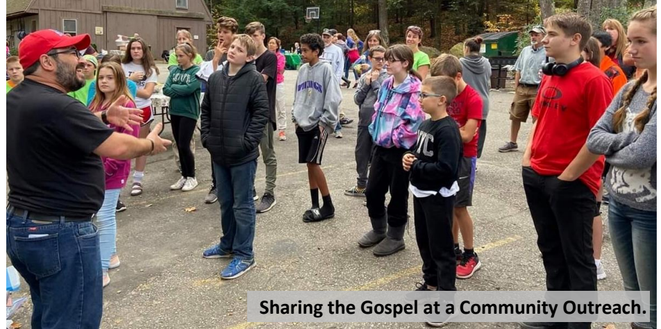
Sharing the Gospel at a Community Outreach.