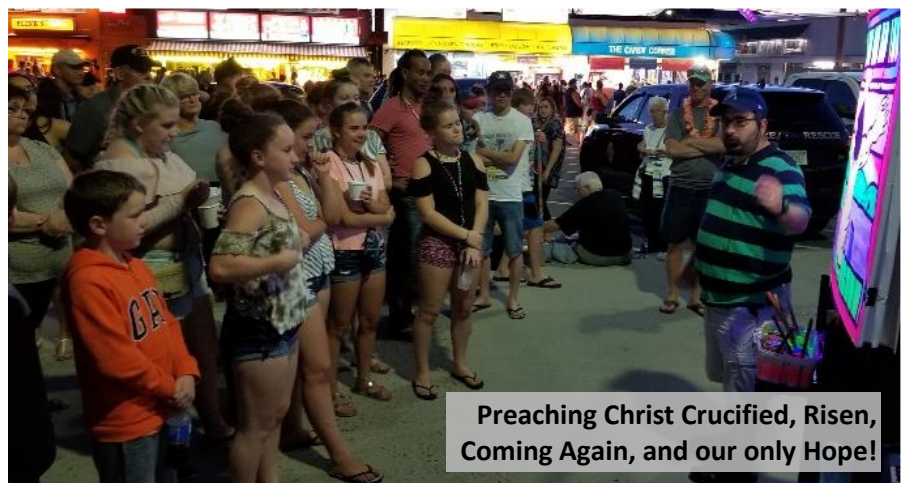
Preaching Christ Crucified, Risen, Coming Again, and our only Hope!