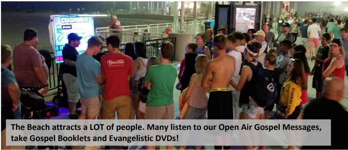
The Beach attracts a LOT of people. Many listen to our Open Air Gospel Messages, take Gospel Booklets and Evangelistic DVDs!