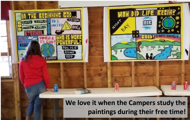
We love it when the Campers study the paintings during their free time!