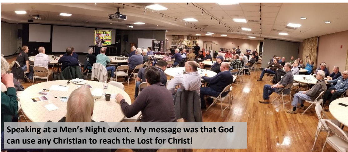
Speaking at a Men's Night event. My message was that God can use any Christian to reach the Lost for Christ!