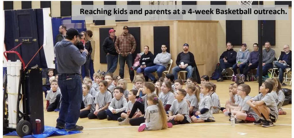
Reaching kids and parents at a 4-week Basketball outreach.