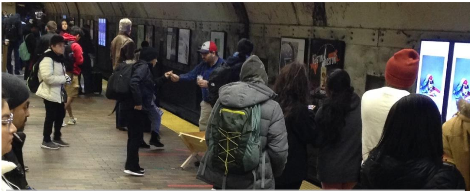
It still amazes that me that people listen to me, a stranger, talk about Jesus. Many, like this woman, approach me and my team to take a gospel booklet.