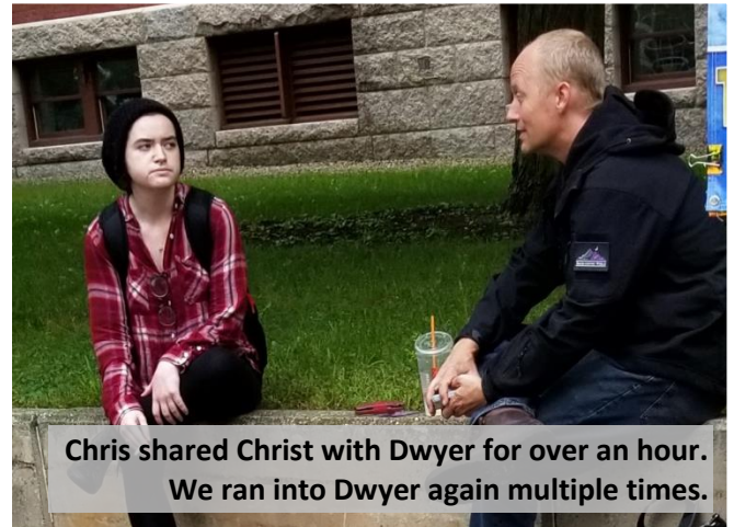
Chris shared Christ with Dwyer for over an hour. We ran into Dwyer again multiple times.