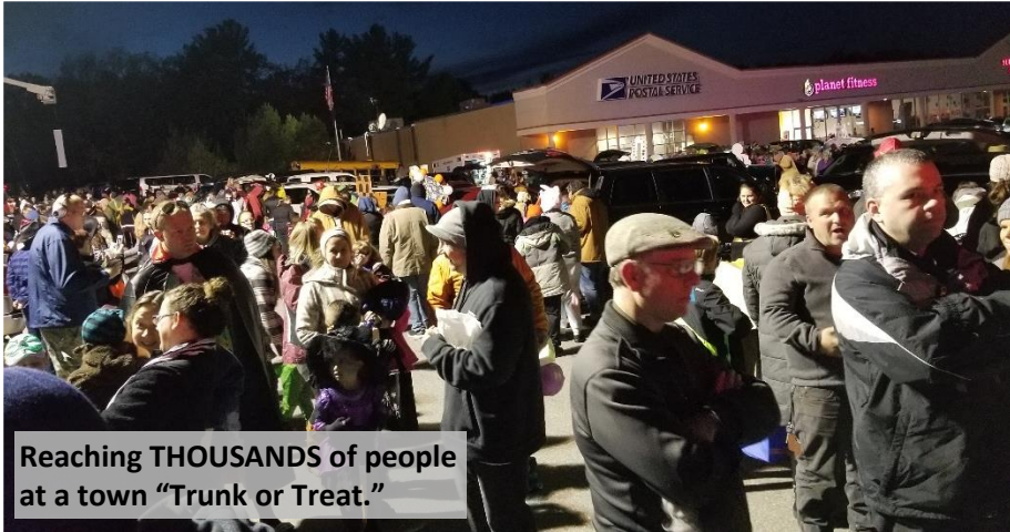
Reaching THOUSANDS of people at a town "Trunk or Treat."