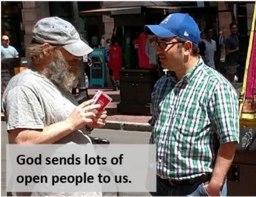
God sends lots of open people to us.