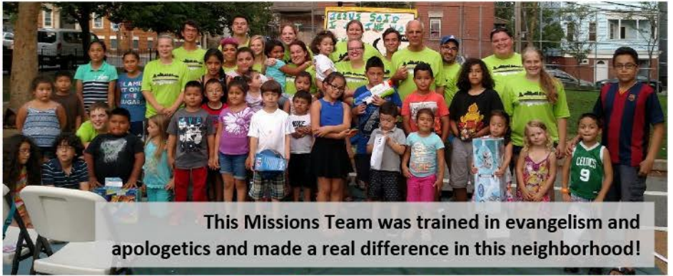
This Missions Team was trained in evangelism and apologetics and made a real difference in this neighborhood!