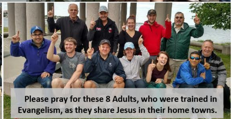
Please pray for these 8 Adults, who were trained in Evangelism, as they share Jesus in their home towns.