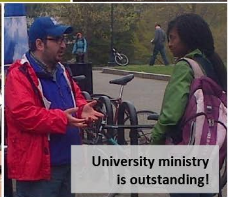
University ministry is outstanding!