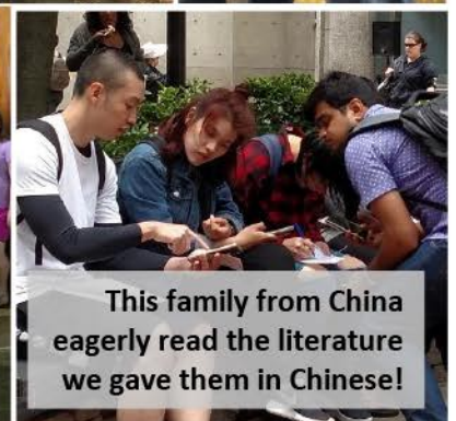
This family from China eagerly read the literature we gave them in Chinese!