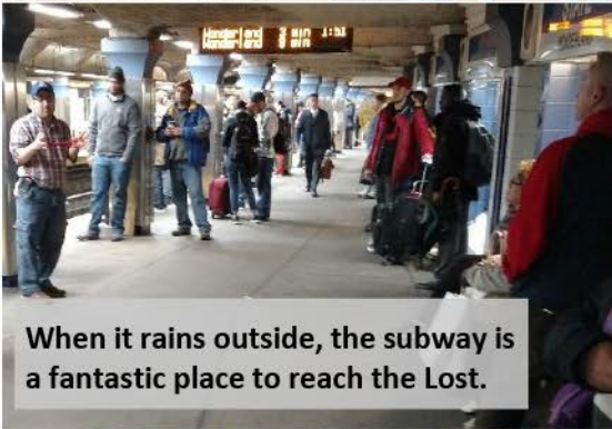
When it rains outside, the subway is a fantastic place to reach the Lost.