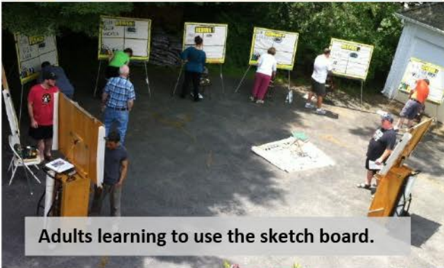
Adults learning to use the sketch board.