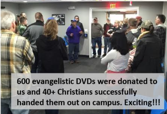
600 evangelistic DVDs were donated to us and 40+ Christians successfully handed them out on campus. Exciting!!!