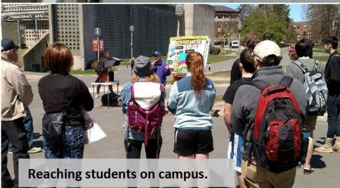
Reaching students on campus.