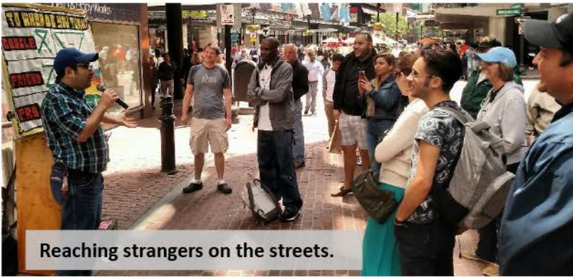
Reaching strangers on the streets.