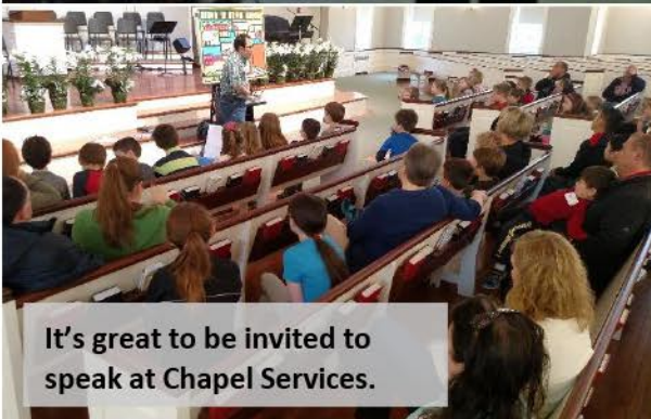
It's great to be invited to speak at Chapel Services.