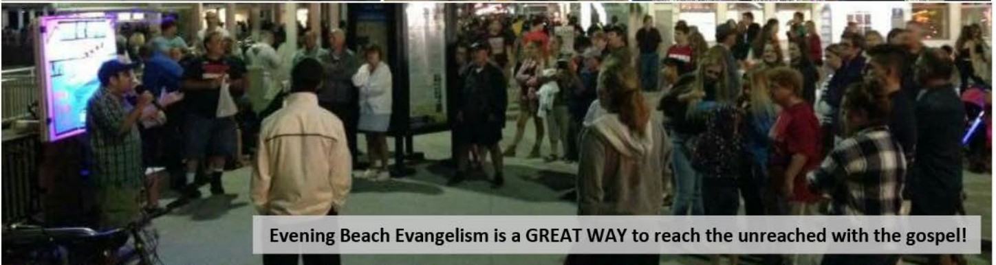
Evening Beach Evangelism is a GREAT WAY to reach the unreached with the gospel!