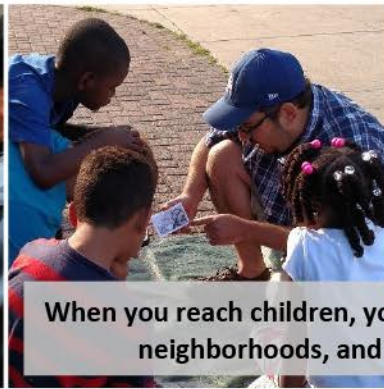
When you reach children, you reach families, neighborhoods, and then the culture.