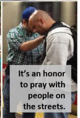
It's an honor to pray with people on the streets.