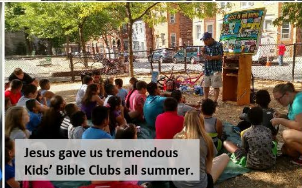
Jesus gave us tremendous Kids' Bible Clubs all summer.