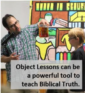
Object Lessons can be a powerful tool to teach Biblical Truth.