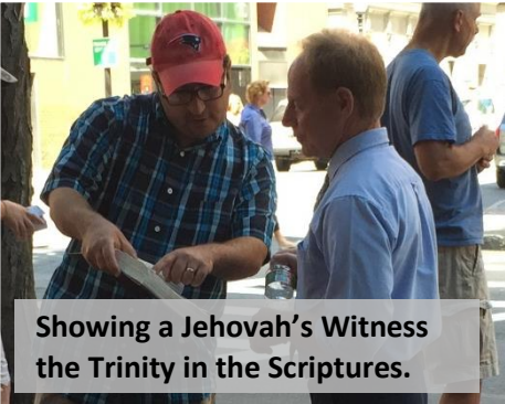
Showing a Jehovah's Witness the Trinity in the Scriptures.

Here's a montage of some of the many opportunities God has given to evangelize and teach: