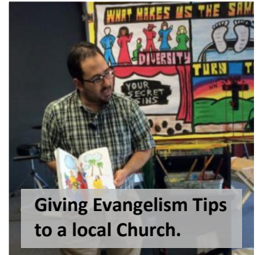
Giving Evangelism Tips to a local Church.