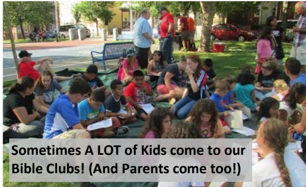
Sometimes A LOT of Kids come to our Bible Clubs! (And Parents come too!)