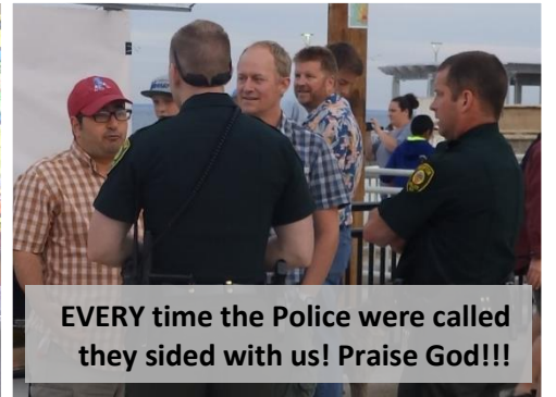
EVERY time the Police were called they sided with us! Praise God!!!

God is doing great things through the Missionary work, but we need your help to continue. Please make us your own personal missionaries to support financially. Please look at the attached sheet on "Deputation."