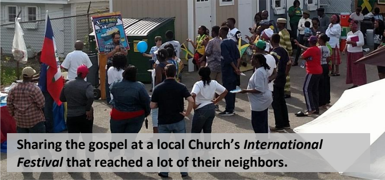
Sharing the gospel at a local Church's International Festival that reached a lot of their neighbors.