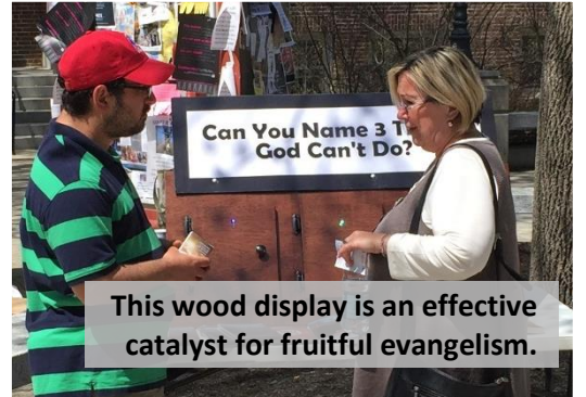
This wood display is an effective catalyst for fruitful evangelism.