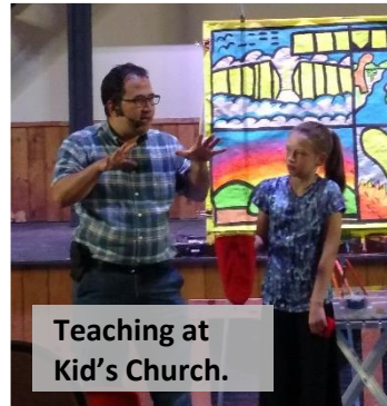
Teaching at Kid's Church.