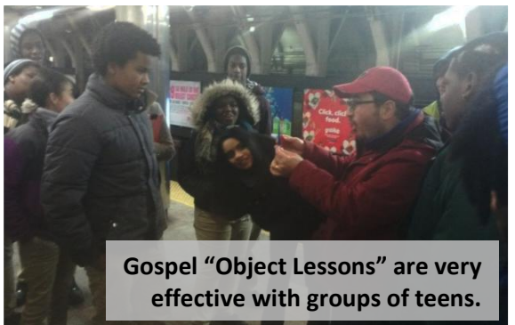
Gospel "Object Lessons" are very effective with groups of teens.

God is doing great things through the Missionary work, but we need your help to continue. Please make us your own personal missionaries to support financially.