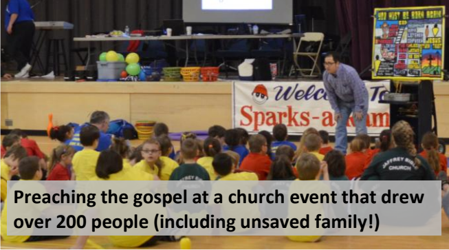
Preaching the gospel at a church event that drew over 200 people (including unsaved family!)