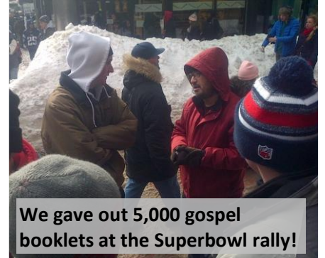
We gave out 5,000 gospel booklets at the Superbowl rally!