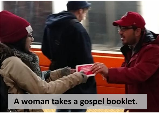
A woman takes a gospel booklet.

Here's a montage of some of the many opportunities God has given to evangelize and teach: