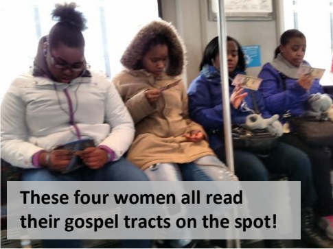
These four women all read their gospel tracts on the spot!