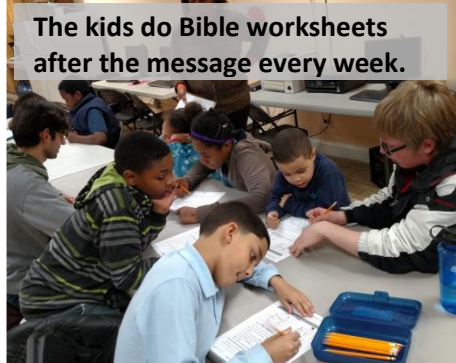
The kids do Bible worksheets after the message every week.