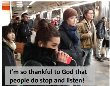
I'm so thankful to God that people do stop and listen!