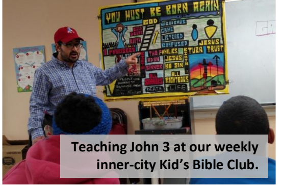
Teaching John 3 at our weekly inner-city Kid's Bible Club.