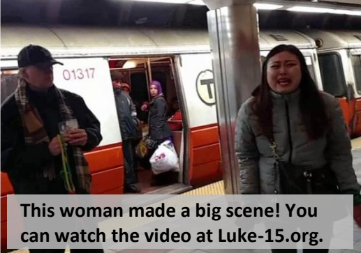
This woman made a big scene! You can watch the video at Luke-15.org.