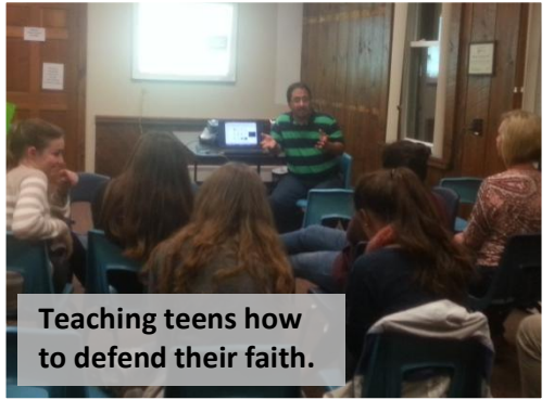
Teaching teens how to defend their faith.