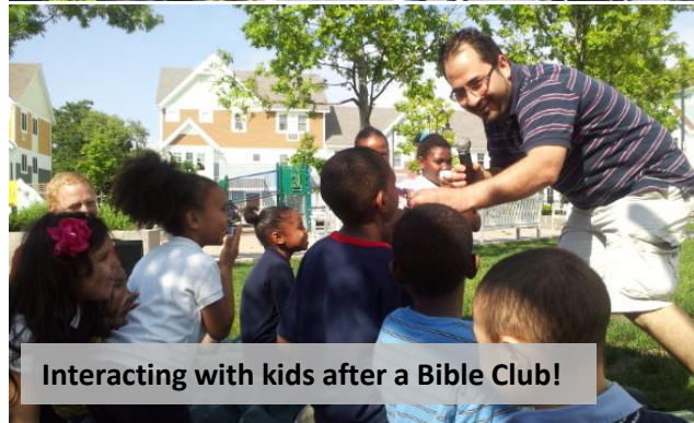
Interacting with kids after a Bible Club!