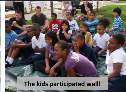
The kids participated well!