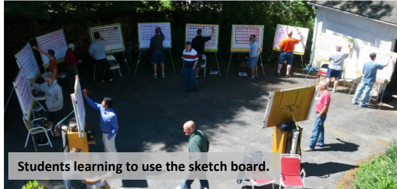
Students learning to use the sketch board.