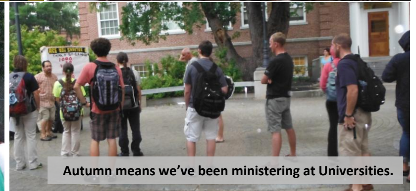
Autumn means we've been ministering at Universities.