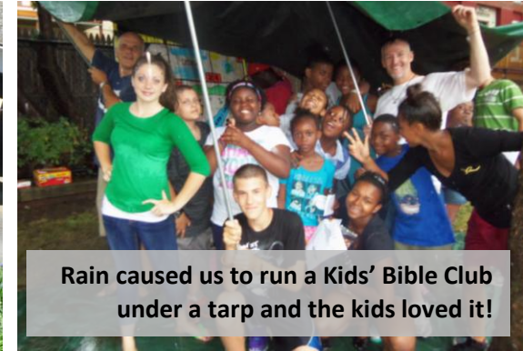
Rain caused us to run a Kids' Bible Club under a tarp and the kids loved it!