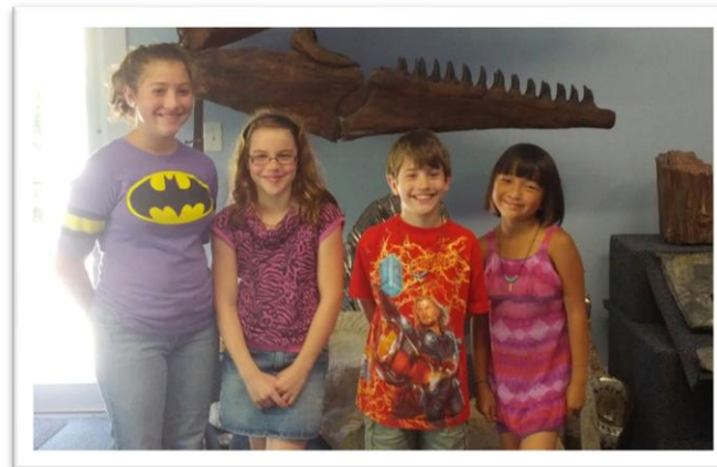
Our kids at The Dinosaur Encounter , a Creation Learning Center in Northern Maine. A highlight of the summer!