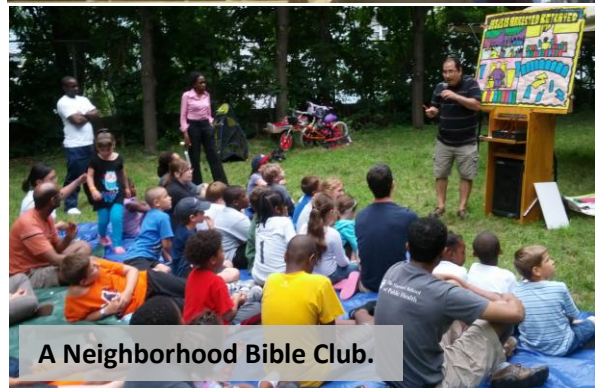
A Neighborhood Bible Club.