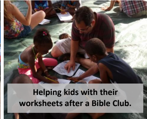
Helping kids with their worksheets after a Bible Club.