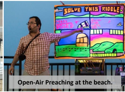
Open-Air Preaching at the beach.