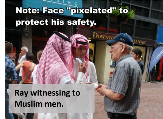
Note: Face "pixelated" to protect his safety.