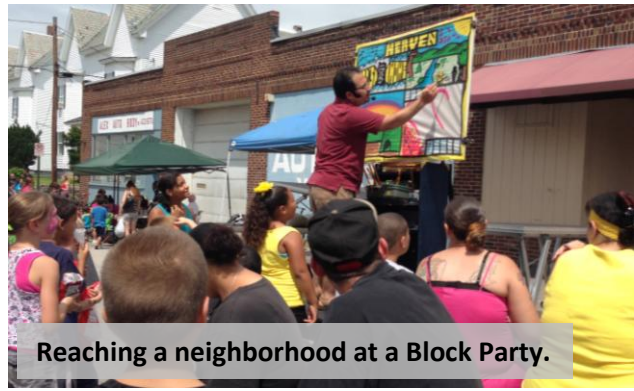
Reaching a neighborhood at a Block Party.