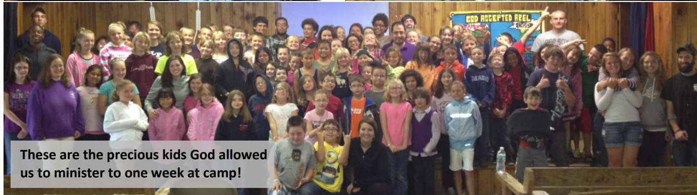
These are the precious kids God allowed us to minister to one week at camp!