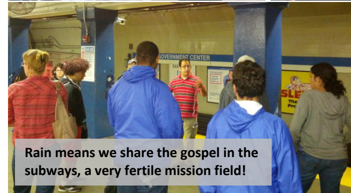
Rain means we share the gospel in the subways, a very fertile mission field!