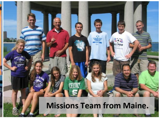
Missions Team from Maine.