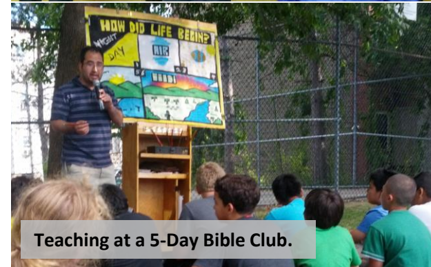
Teaching at a 5-Day Bible Club.