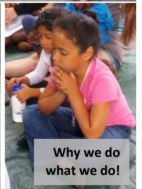
Why we do what we do!