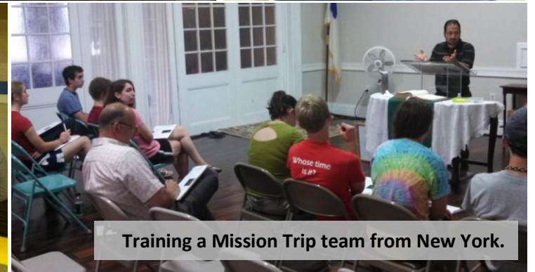
Training a Mission Trip team from New York.