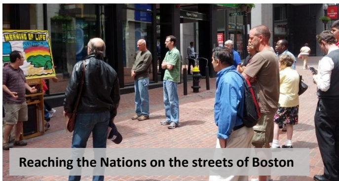
Reaching the Nations on the streets of Boston