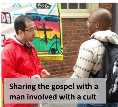
Sharing the gospel with a man involved with a cult