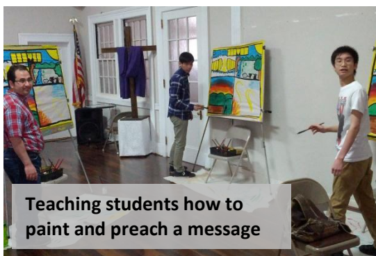
Teaching students how to paint and preach a message