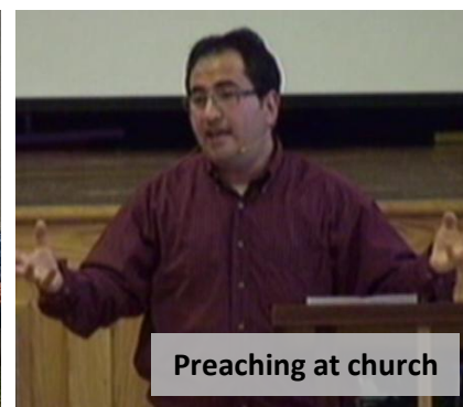
Preaching at church

Please make us your own personal missionaries to support financially. Whatever your role, whether it be going or sending, you are an essential part of the work that God is doing. Your reward in Heaven will be beyond what you can imagine!