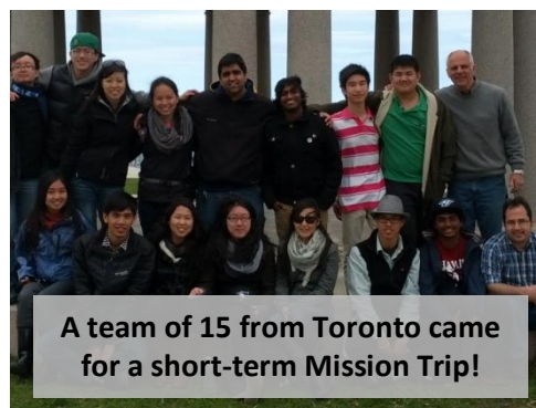
A team of 15 from Toronto came for a short-term Mission Trip!