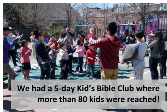
We had a 5-day Kid's Bible Club where more than 80 kids were reached!