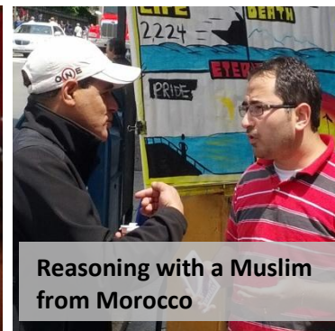
Reasoning with a Muslim from Morocco