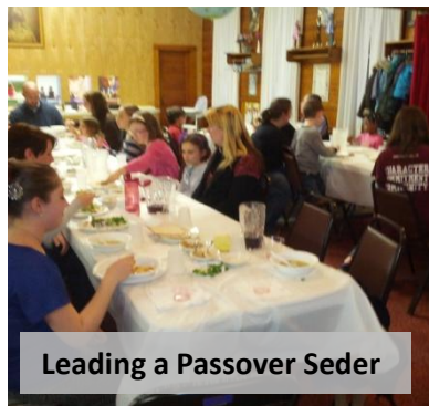
Leading a Passover Seder