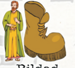
Bildad the Shuhite