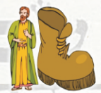
Bildad the Shuhite

How long before you stop speaking? Are we vile in your site? The evil get destruction. Bad things happen to bad people. 18:1-21