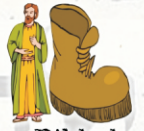
Bildad the Shuhite

God is just. If you were pure and upright, God would prosper you. The wicked will not prosper. 8:1-22